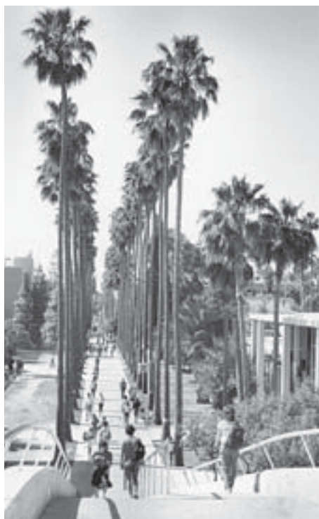
Palm Walk is one of the most picturesque spots on the Arizona State campus.

ASU is an active partner with the private sector in initiatives to enhance the social well-being, economic competitiveness, cultural depth, and quality of life of metropolitan Phoenix and the state.