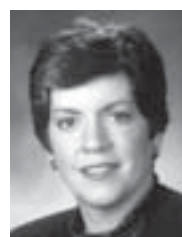
Janet Napolitano Governor