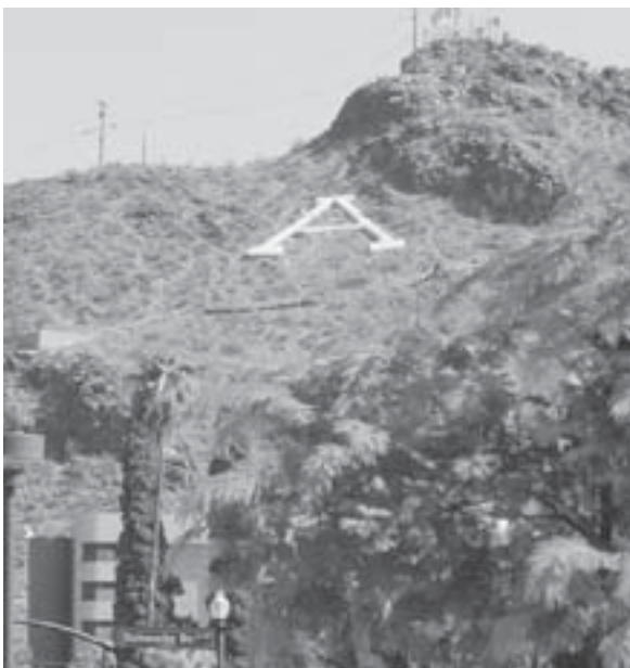
"A" Mountain is one of the most traditional sites on ASU's campus. Each November students protect the "A" from Wildcat white-washers before the ASU-UofA rivalry game.